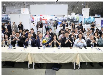
AI Trend Forum