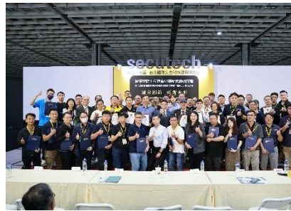
Seminar on Smart Security Engineering Technology and Innovative Practices