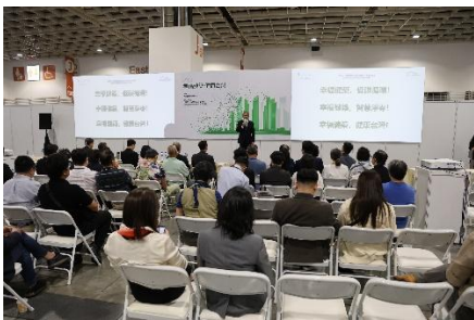
Safe Buildings Summit