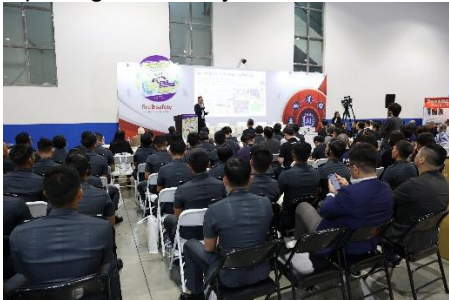
Asia Disaster Prevention Summit