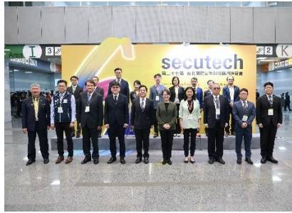
The Vice Presidents Visits Secutech