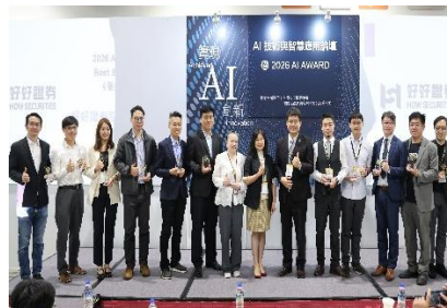
AI Award Ceremony