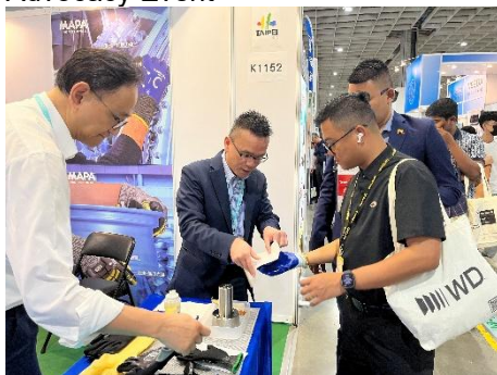
Introducing products to buyers from Myanmar