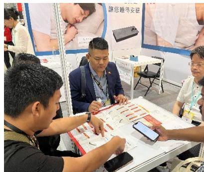
Business Matching Session