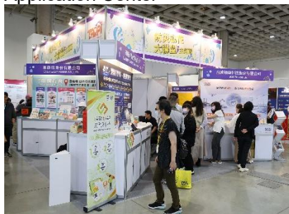
Taiwan Association of Disaster Prevention Industry Pavilion