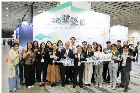
“Healthy Buildings, Healthy Taiwan” Advocacy Event