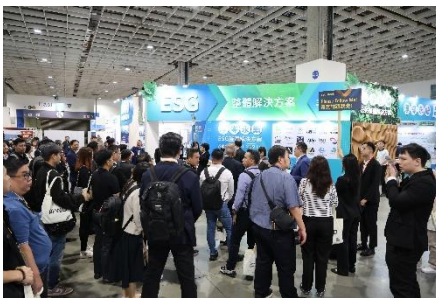
ESG Total Solution Pavilion