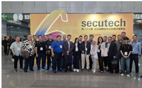
Group photo of overseas buyers