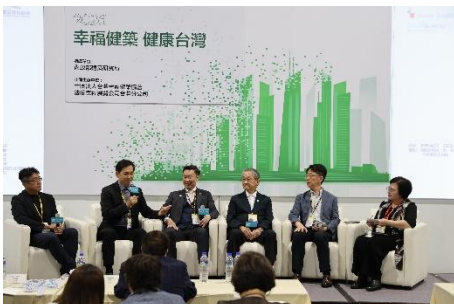
Healthy Building Forum